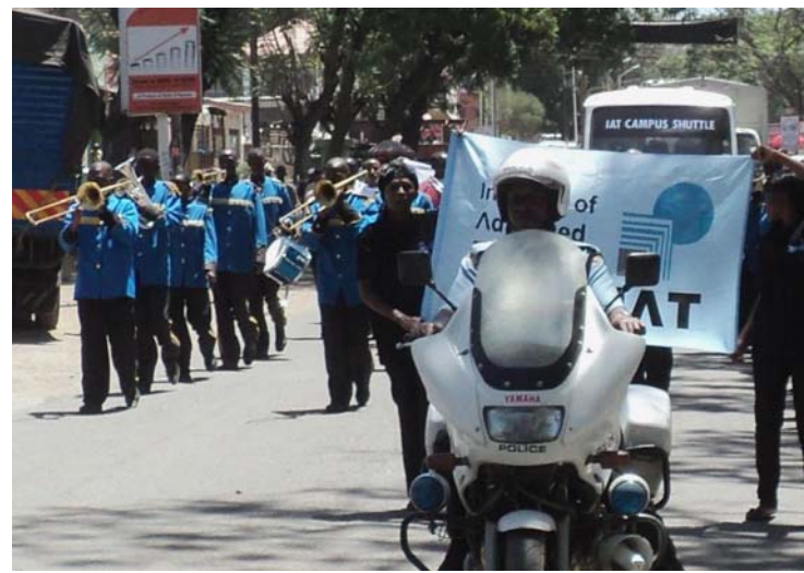
Pump, color and Fun.