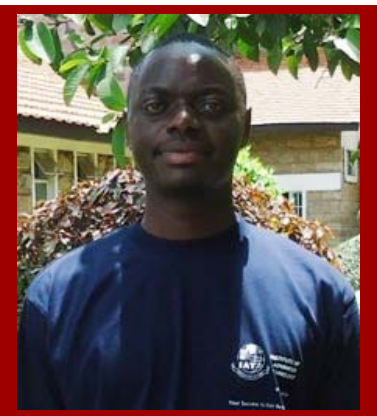
By Benard Odhiambo Ondiek, Sports Master, IAT Thika Road Campus

So...get healthy...get social...get sporty!!