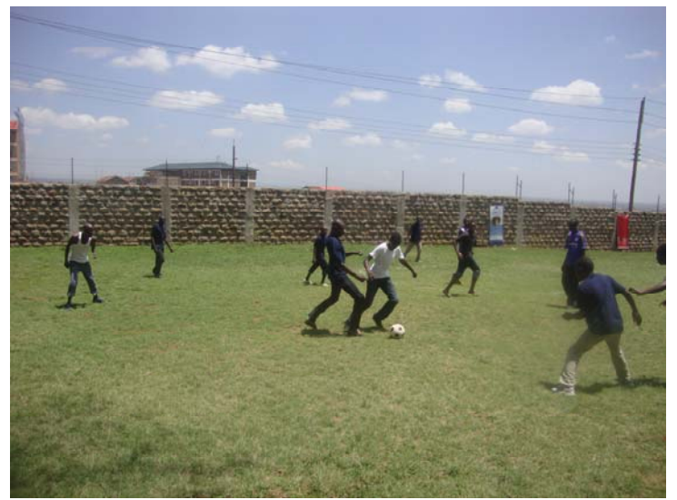
Students vs staff. IAT Thika Road Campus football competition.