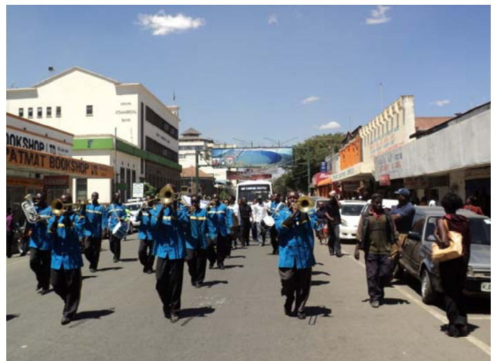
The Nakuru Brass Band leads the IAT Nakuru staff in a Procession during the campus launch.