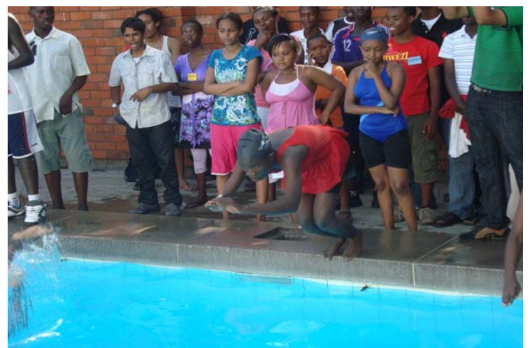
IAT Mombasa Campus students have a splash during their Career Day at the campus.