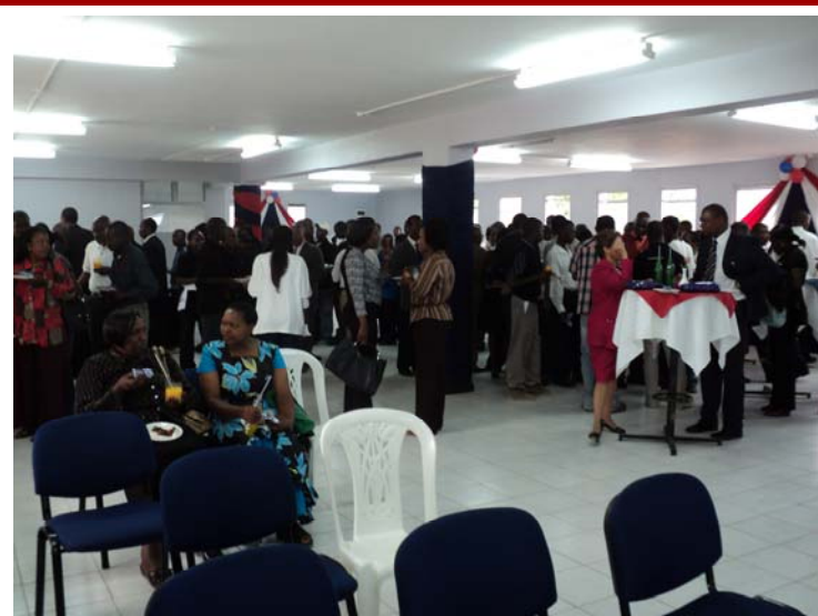
Then came the cocktail.....