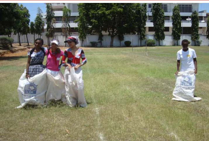
IAT Mombasa students enjoy a sack race during their Career Day.