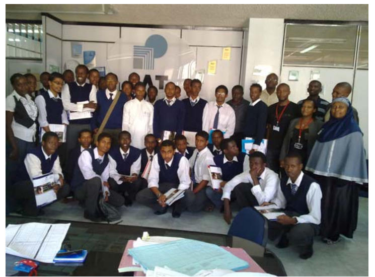
Rasul Al Akram High School pose for a group photo with IAT staff, during their visit at IAT Pension Towers.